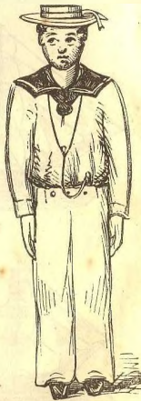
Standing at attention.