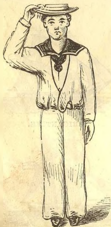
Touching the Hat.