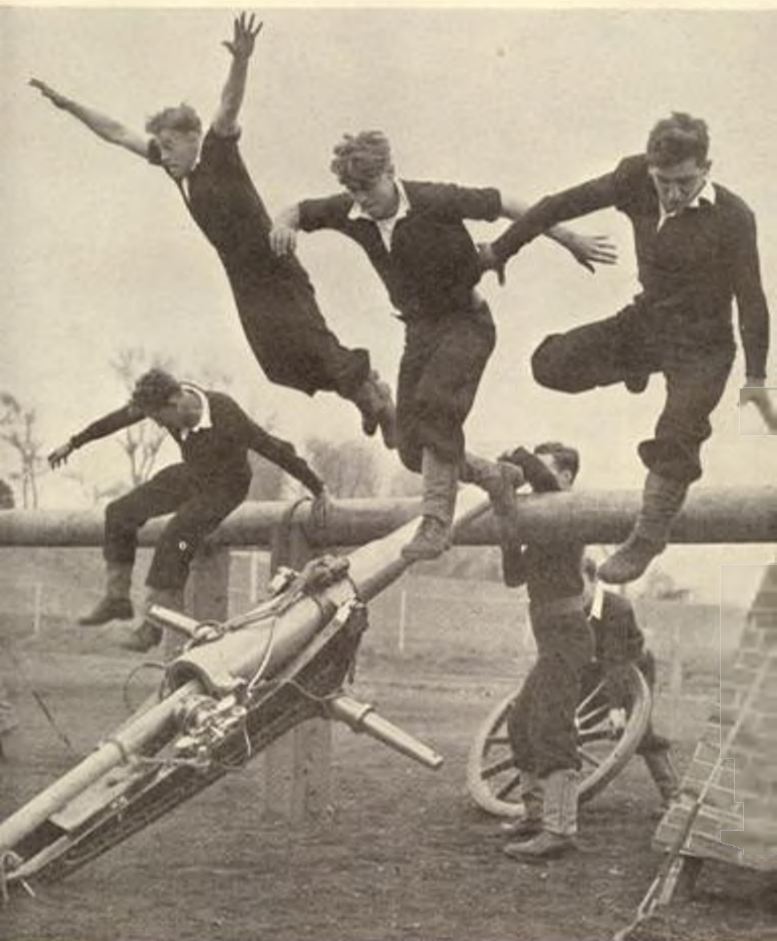
The Portsmouth team practising for the Bold gun competition in the Royal Tournament